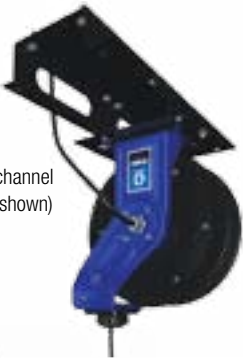
Channels available to accommodate one to six reels (24N682 shown)