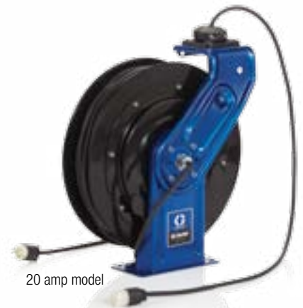
20 amp model