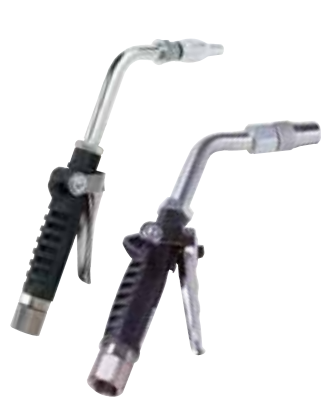
SDV15 and XDV20 Control Valves