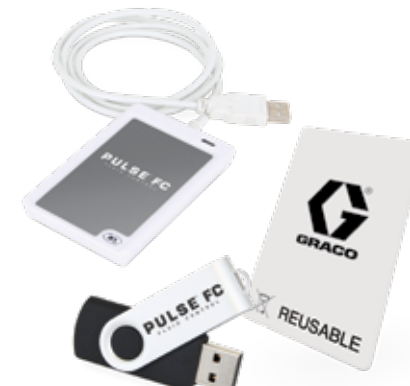
Pulse FC Upgrade Kit