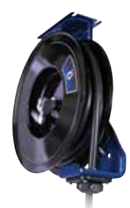
SD 10 / 20 Series™