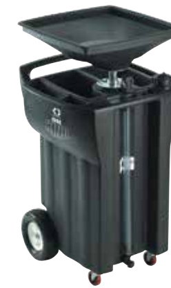
Oil & Coolant King™