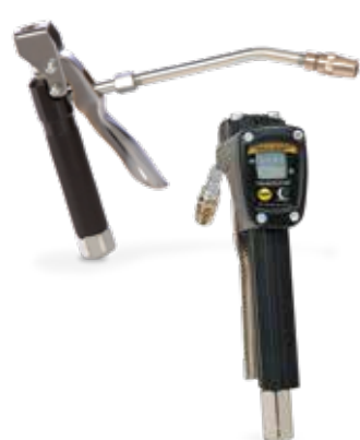
Grease Dispense Valves