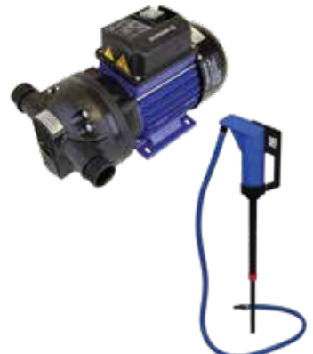
LD Series™ Blue Pumps