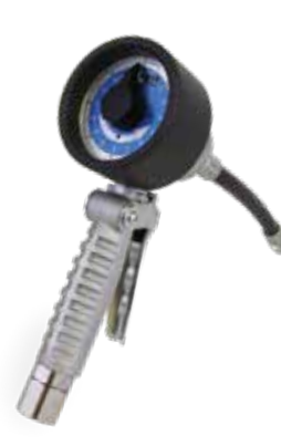
SD Series™ Mechanical Meters