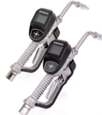
SD Series™ Meters