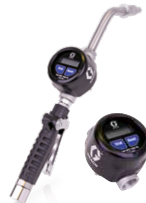
EM® Series Meters