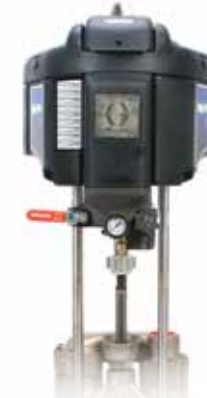
NXT® Supply Systems