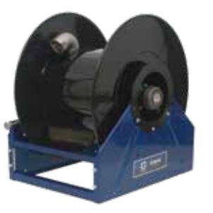
XD 60 / 70 / 80 Series™ Powered Reels