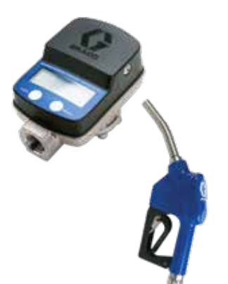
SD Series™ DEF Meter & Valves