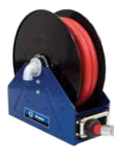
XD 40 / 50 Series™