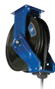
XD 10 / 20 / 30 Series™