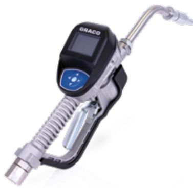
Pulse® Pro Meter