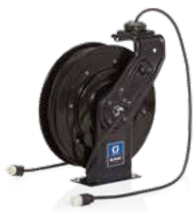
SD Series™ Cord and Light Reels