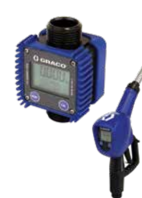
SD Series™ DEF Meter & Valves