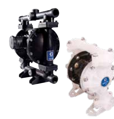
Husky™ Diaphragm Pumps